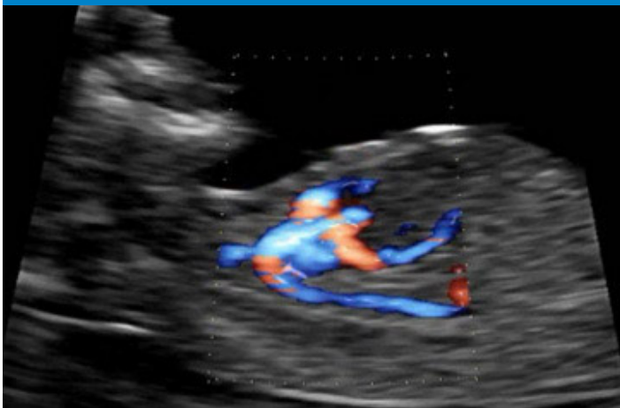
Images from a fetal echocardiogram at 14 weeks EGA showing a normal aortic arch and 4 chamber view

Our Fetal Cardiology Program now has the equipment and operator expertise to assess the fetal heart as early as 13-14 weeks gestation. We can provide families with reliable diagnosis of fetal cardiac abnormality in those high-risk pregnancies where early diagnosis is desired. Because early fetal cardiac imaging is a novel technology, we do recommend in most cases that mothers undergoing early fetal echocardiography have a repeat study at 18-20 weeks gestation to confirm the initial findings.